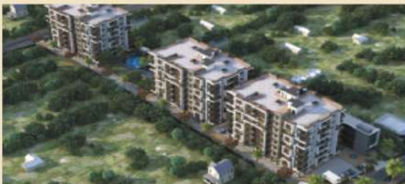
SINGH VILLA Gola Road, Patna