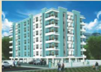
Jamuna Tower Ashok Nagar, Patna