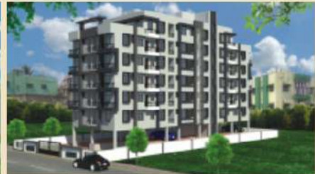
Mateshwari Residency Near Patna Central School, Bypass, Patna