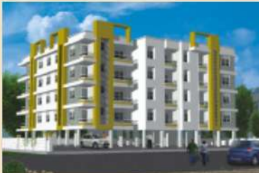
Girja Complex Near Patna Central School, Jaganpura, Patna